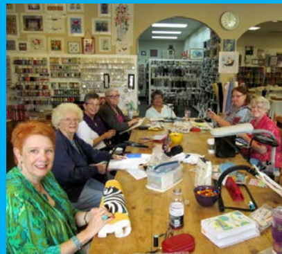
Happy Stitchers at Madonna's!