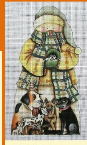
LA-CC04 Doggie Snowman

The selection of canvases being featured this month from Painted Pony is spectacular! Painted Pony Designs is famous for the hundreds of topical angels for every occasion. What is not well known is that this company represents the art and designs many artists.