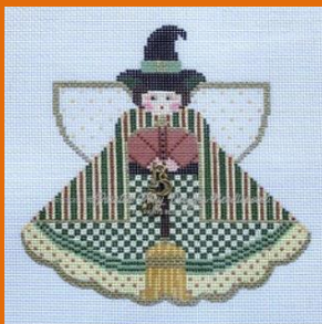
PP-996KW Broom Hilda

Painted Pony Designs www.paintedponyneedlepoint.com September 1 st - September 30th 10% off all trunk show designs